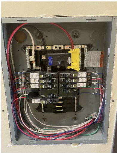
Installation of Subpanel Wiring