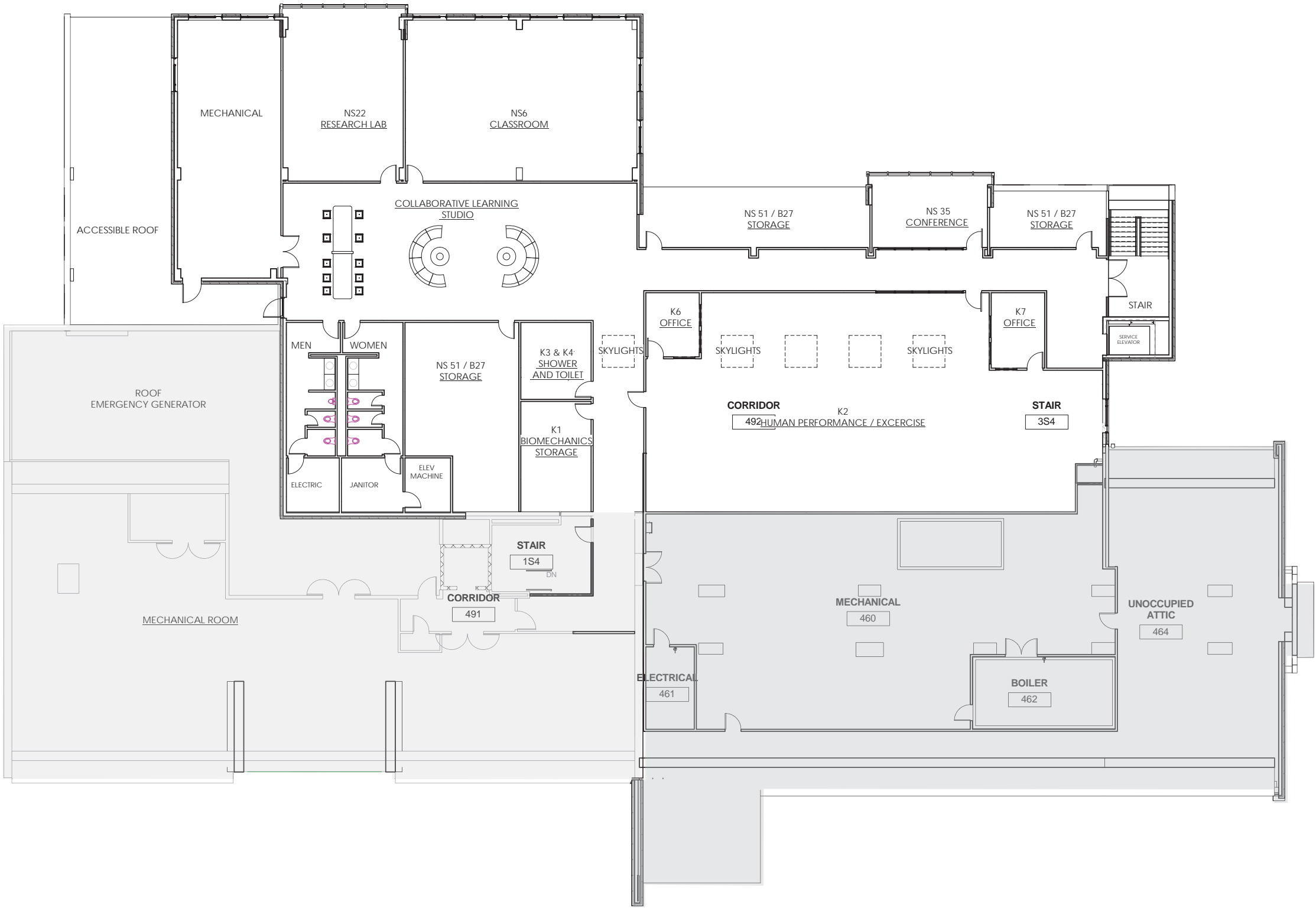
1 PHASE 2 4TH FLOOR 3/32" = 1'-0"