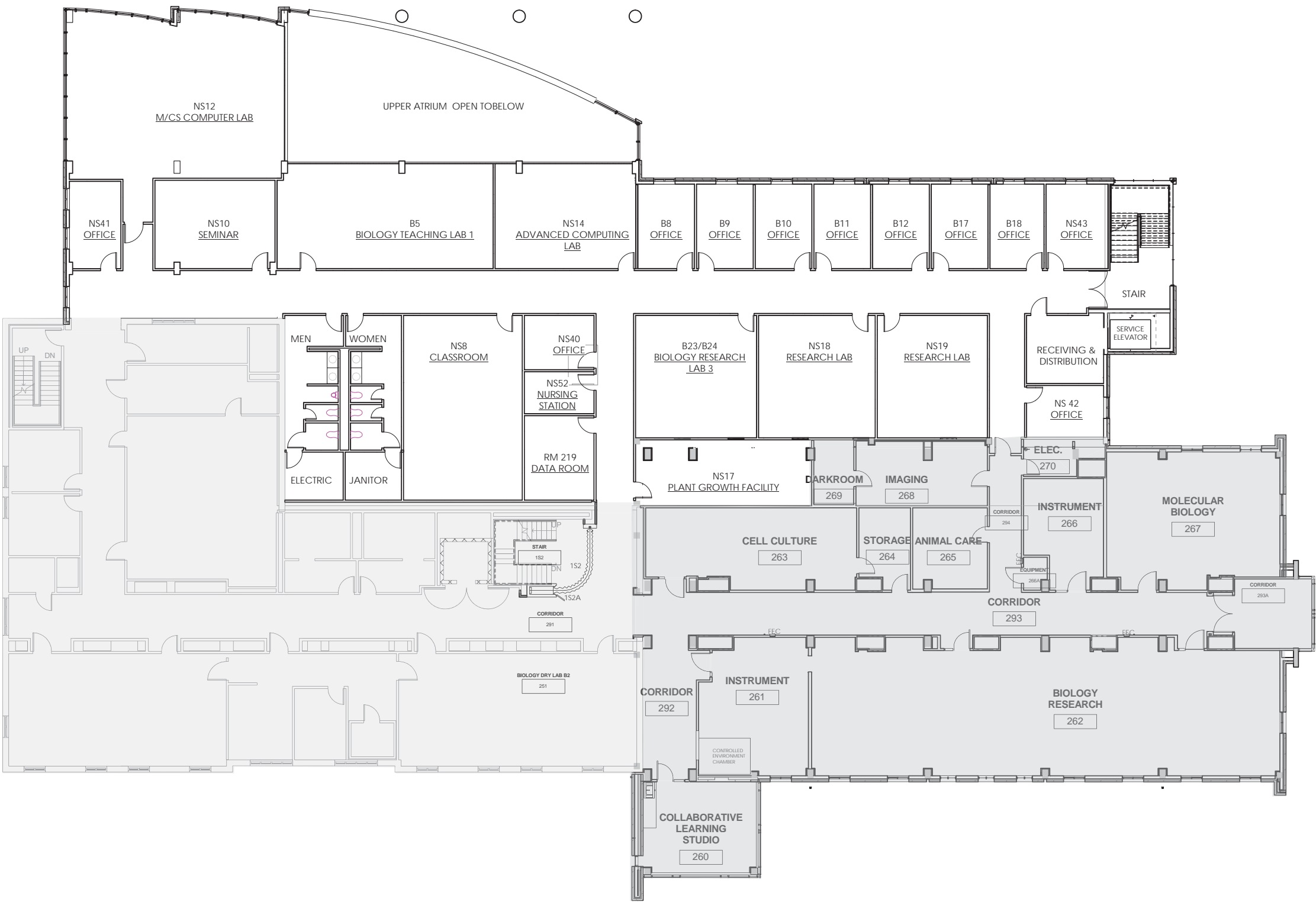
① PHASE 2 2ND FLOOR PLAN 3/32" = 1'-0"