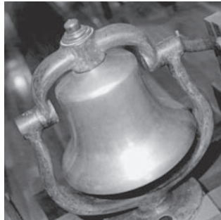
The Rutersville Bell signals the start of community gatherings and dates back to Southwestern's first root institution, Rutersville College.

Over the next several decades, Southwestern emerged as Texas' central Methodist college. Struggling with enrollment and finances during the 1920s and 1930s, Southwestern was