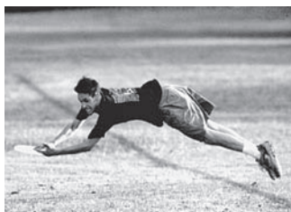
Ultimate Frisbee is one of many intramural sports offered at Southwestern University.

Southwestern Intramural and Recreational Activities (SIRA) provides the University community with opportunities for physical, social and educational development through participation in intramural, fitness/wellness, sport club and outdoor recreation programs. Intramurals provide competition on organized teams and individual sports at various skill levels. More than 20 leagues, tournaments and special events are offered annually with men's, women's and co-rec divisions of play.